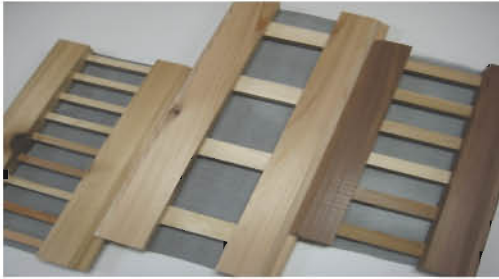
STYLES 95, 32, and 64