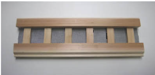
CEDAR 4 INCH STYLE 64

Our SOFFIT VENTS are made from kiln dried premium wood products, and come in three basic styles (32, 64, and 95), two different sizes, and four different wood types: Western Red clear and stk cedar or pine, as well as combination of fir rails with pine centers.