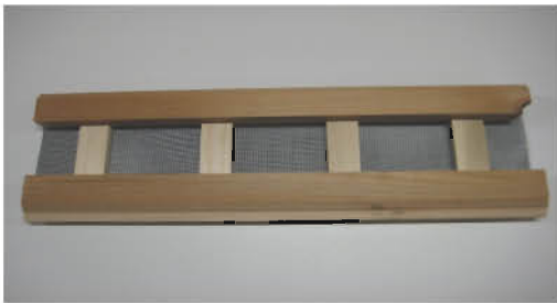
Max-Airflow-CEDAR 4 INCH STYLE 32