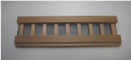
CEDAR 4 INCH STYLE 95